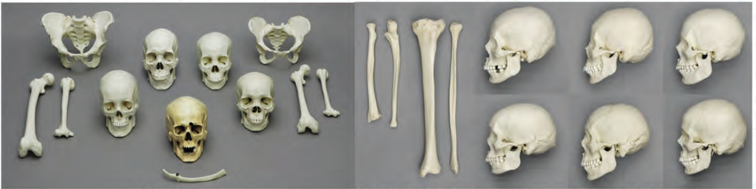
COMP-114 Forensic Osteology Set with Lesson Plan