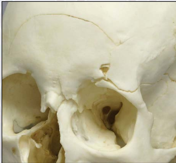
Figure 4: Frontal Bone and Left Orbit

One impact point is on the left supraorbital margin. A fracture proceeds superiorly and another fracture branches off and arcs across the anterior portion of the frontal to just above the right supraorbital margin. The arcing fracture is a typical “concentric fracture” caused by bending (plastic deformation) of the bone around the point of impact.