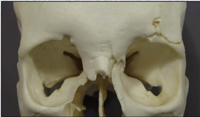
Figure 2: Frontal View of Orbits

This is a typical female cranium. The forehead is smoothly curved without frontal bossing, and the supraorbital margins are sharp. The mastoid processes are relatively small, and there is no suprameatal crest. The nuchal area of the occipital is relatively smooth and devoid of ridges, and there is no nuchal protuberance.