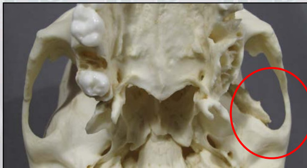
Figure 6: Basilar View of Cranium and Temporal Bone Trauma

There is one more small fracture on the frontal bone near the right side of the coronal suture. It is not obvious whether or not this fracture is associated with any of the others.