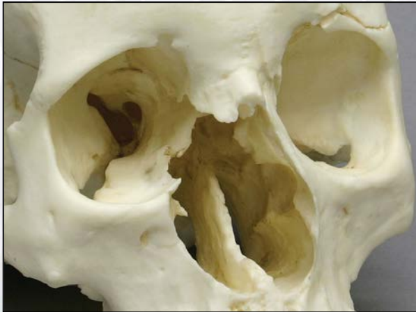
Figure 5: Left Medial Orbital Wall and Nasal Bones

The frontal process of the right maxilla is broken off and missing together with the right lacrimal, part of the right lateral wall of the ethmoid, and the nasal conchae. The nasal bones are broken off at 8 mm. below nasion (the bridge of the nose). Another fracture line extends posteriorly on the orbital roof.