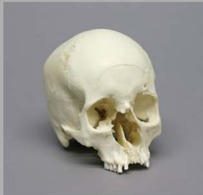
Product No. BCM-805