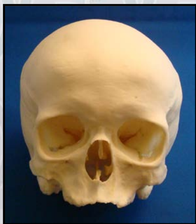
Figure 1: Frontal View of Cranium

The neurocranium is large in relation to the face. The forehead bulges and double bossing is visible on the frontal bone (See Figure 1). The nasal bridge is depressed, the nasal spine is large and the nasal bones appear constricted, bending sharply and jutting outward (See Figure 2).