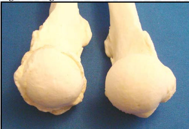
Figure 5: Right and Left Humeral Heads

The elbow joints are extremely arthritic (See Figure 6 ). The capitulum of the left humerus is eburnated from the effects of bone-on-bone articulation between the humerus and radius, and the movement of the ulnae on the troclea of the humeri is severely limited. Extension is not possible beyond 90 degrees, making the arms permanently bent. (Complete extension would be 180 degrees.)