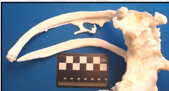
Figure 7: Kyphosis and Fusion: Seven vertebrae in the center of the back (T8-L2) are fused into a solid bony mass, producing a permanent hump back deformity ( kyphosis ). Three ribs are fused to the vertebral mass.

Within the fused section of vertebrae, three ribs are fused to the vertebral mass. The right tenth rib is missing, possibly due to its delicate condition at the time of death. Large syndesmophytes (bony growth within ligaments) are found attached to the inferior border of the ninth rib and may indicate the remains of a fractured and mostly-resorbed tenth rib.