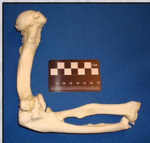
Figure 6: Reduction of Elbow Extension: The elbows are permanently flexed. Neither one extends much beyond a 90 degree angle to the humerus. This is due to buildup of osteophytic bone and closure of the olecranon fossa of the humerus.

The elbow joints are extremely arthritic (See Figure 6 ). The capitulum of the left humerus is eburnated from the effects of bone-on-bone articulation between the humerus and radius, and the movement of the ulnae on the troclea of the humeri is severely limited. Extension is not possible beyond 90 degrees, making the arms permanently bent. (Complete extension would be 180 degrees.)