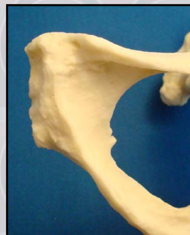
Figure 8: Female Pubis

The sacrum is fused to the right innominate (but not the left) and is unusually flat. The auricular surfaces of the sacrum are greatly reduced and sharply curved. The superior surface of S1 is decidedly angled, resulting in an extreme anterior projection of the sacral promontory (See Figure 9).