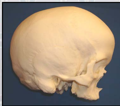
Figure 2: Lateral View of Cranium