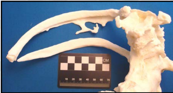
Figure 7: Kyphosis and Fusion: Seven vertebrae in the center of the back (T8-L2) are fused into a solid bony mass, producing a permanent hump back deformity ( kyphosis ). Three ribs are fused to the vertebral mass.

Within the fused section of vertebrae, three ribs are fused to the vertebral mass. The right tenth rib is missing, possibly due to its delicate condition at the time of death. Large syndesmophytes (bony growth within ligaments) are found attached to the inferior border of the ninth rib and may indicate the remains of a fractured and mostly-resorbed tenth rib.