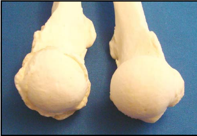
Figure 5: Right and Left Humeral Heads

The elbow joints are extremely arthritic (See Figure 6 ). The capitulum of the left humerus is eburnated from the effects of bone-on-bone articulation between the humerus and radius, and the movement of the ulnae on the troclea of the humeri is severely limited. Extension is not possible beyond 90 degrees, making the arms permanently bent. (Complete extension would be 180 degrees.)