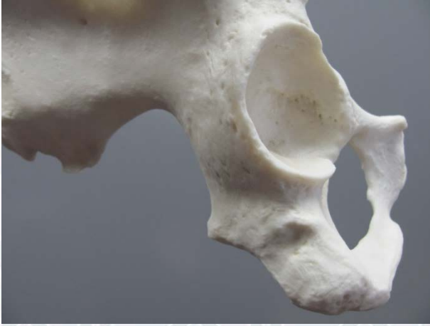
Figure 1: The greater sciatic notch is wide, which is indicative of females.