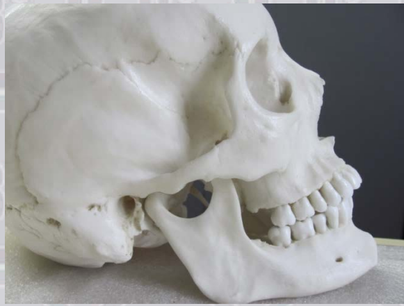
Figure 4: Poor dental occlusion indicates European descent.