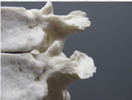
Figure 5: 9 th and 10 th thoracic vertebrae.

There is no evidence of trauma. There is osteophyte development on the left transverse processes of T9 and T10, as well as on the left superior and inferior articular facets of C4 and C5.