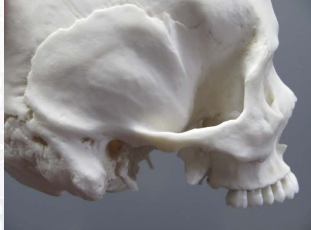
Figure 2: The mastoid process is small, which is often the case in female skulls.