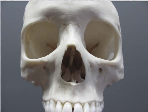
Figure 3: Narrow nasal aperture, which is indicative of European ancestry.

A variety of morphological traits of the skull were used to determine the European ancestry of this individual. For example, the nasal aperture is narrow/vertical, and there is poor dental occlusion (overbite), which are all morphological traits indicative of Europeans.