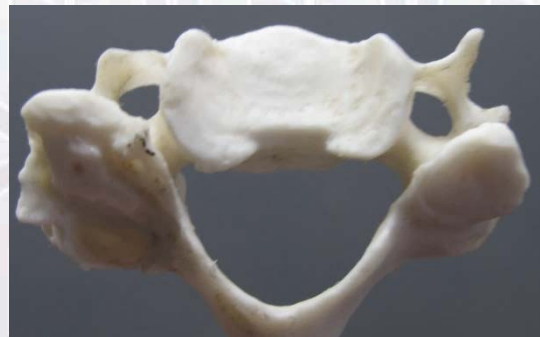
Figure 6: 4 th cervical vertebra.